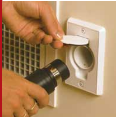
Easy to insert cuff

Ask a Volta Dealer to calculate which machine in the range is right for you. While you are there ask about the no bag, self cleaning filter - the easy to clean bin collection system. Have you heard about the new serenity quiet machines?