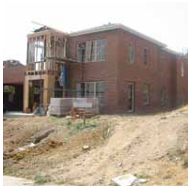
New home installation