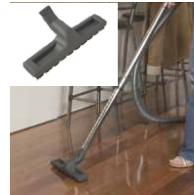
Hard floor brush