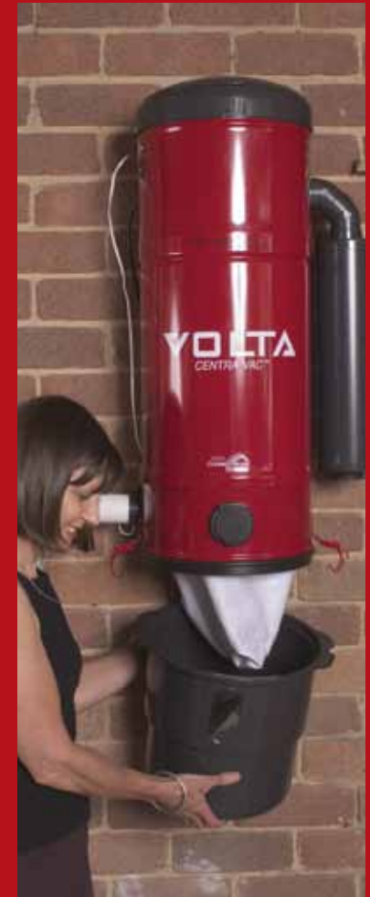
Easy to empty bin

The right machine combined with high suction levels, removes more dirt and debris from inside your home to an outside location, which means cleaner and healthier living.