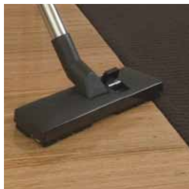
Hard and soft floors