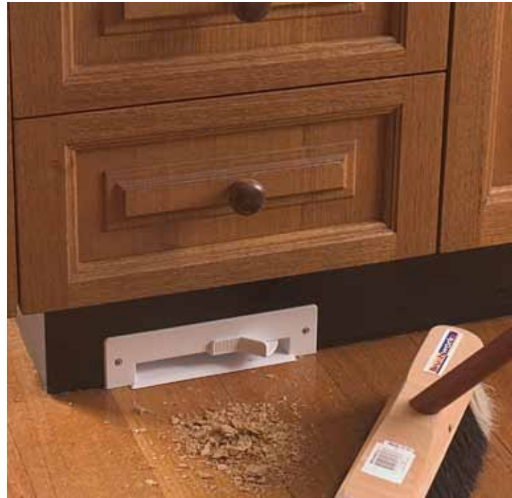
Vacpan for kitchen