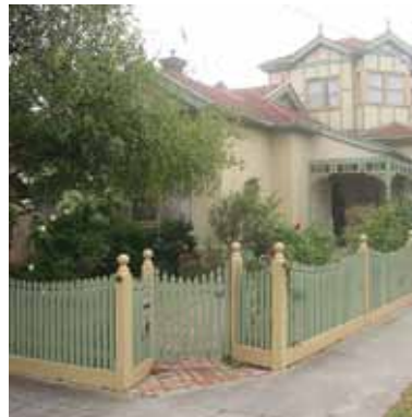
Existing home installation

Nearly all Volta ducted vacuum systems use a bin system for collecting the dirt. Simply unclip the bin and empty the contents in to a rubbish bag or perhaps in to the garden compost. The cyclonic action of the machine, combined with the high filtration, self cleaning filter, means never having to buy vacuum bags again. The filter works so well, outside venting is not required.