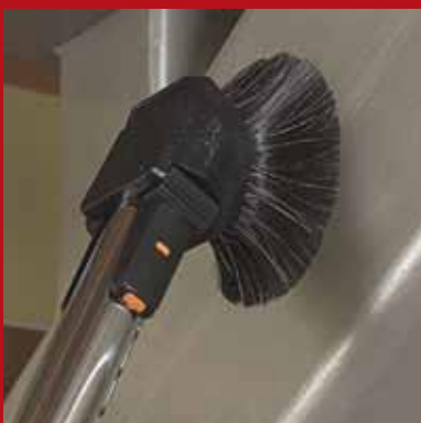
Versatile dusting brush